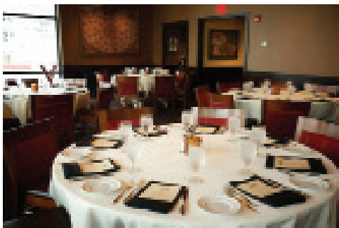
Beer Baron Hall Facing East