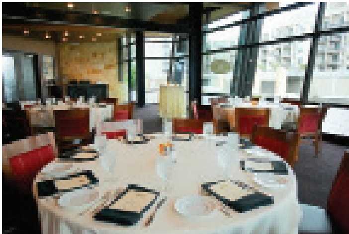
Beer Baron Hall Facing West

The Beer Baron Hall is our largest private dining space with two walls of floor to ceiling windows overlooking The Banks area and Great American Ballpark. This space can accommodate large events or be separated into two spaces, Beer Baron Hall - East and Beer Baron Hall - West, to accommodate smaller events. Seated capacities are based on 60" rounds which seat 8 guests.